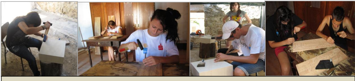
Students learning at the Stolac Stone and Wood Carving Workshops

These workshops will have a competitive aspect and participants will receive awards for creativity. Each workshop will last 5 days. Participants will be able to take part in all workshops and contribute to the revival of forgotten skills.