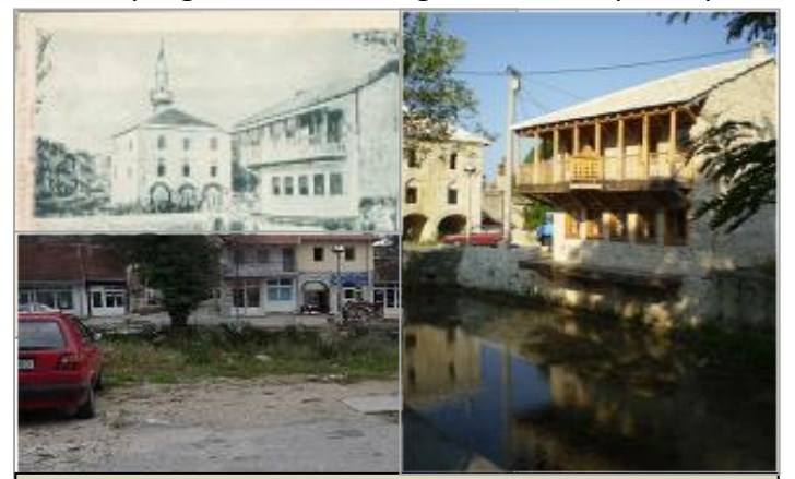
The Podgradski Konak before and after destruction and after rebuilding as the Human Rights Centre

The initial schools used practical examples of cross-cultural cooperation to restore heritage as a tool against segregation and